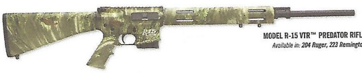
MODEL R-15 VTR™ PREDATOR RIFLE Available in: 204 Ruger, 223 Remington