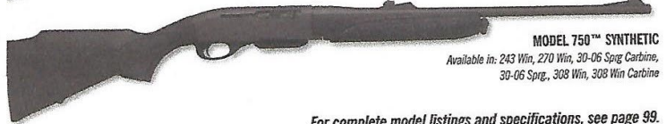
MODEL 750™ SYNTHETIC Available in: 243 Win, 270 Win, 30-06 Sprg Carbine, 30-06 Sprg., 308 Win, 308 Win Carbine

For complete model listings and specifications, see page 99.