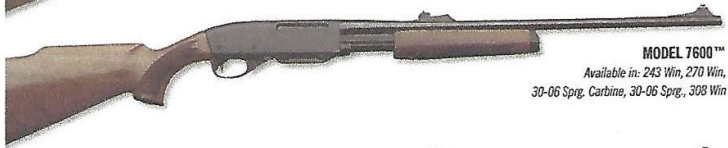
MODEL 7600™ Available in: 243 Win, 270 Win, 30-06 Sprg. Carbine, 30-06 Sprg., 308 Win