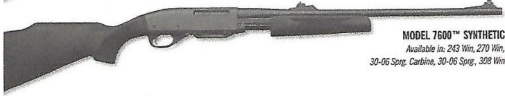
MODEL 7600™ SYNTHETIC Available in: 243 Win, 270 Win, 30-06 Sprg. Carbine, 30-06 Sprg., 308 Win